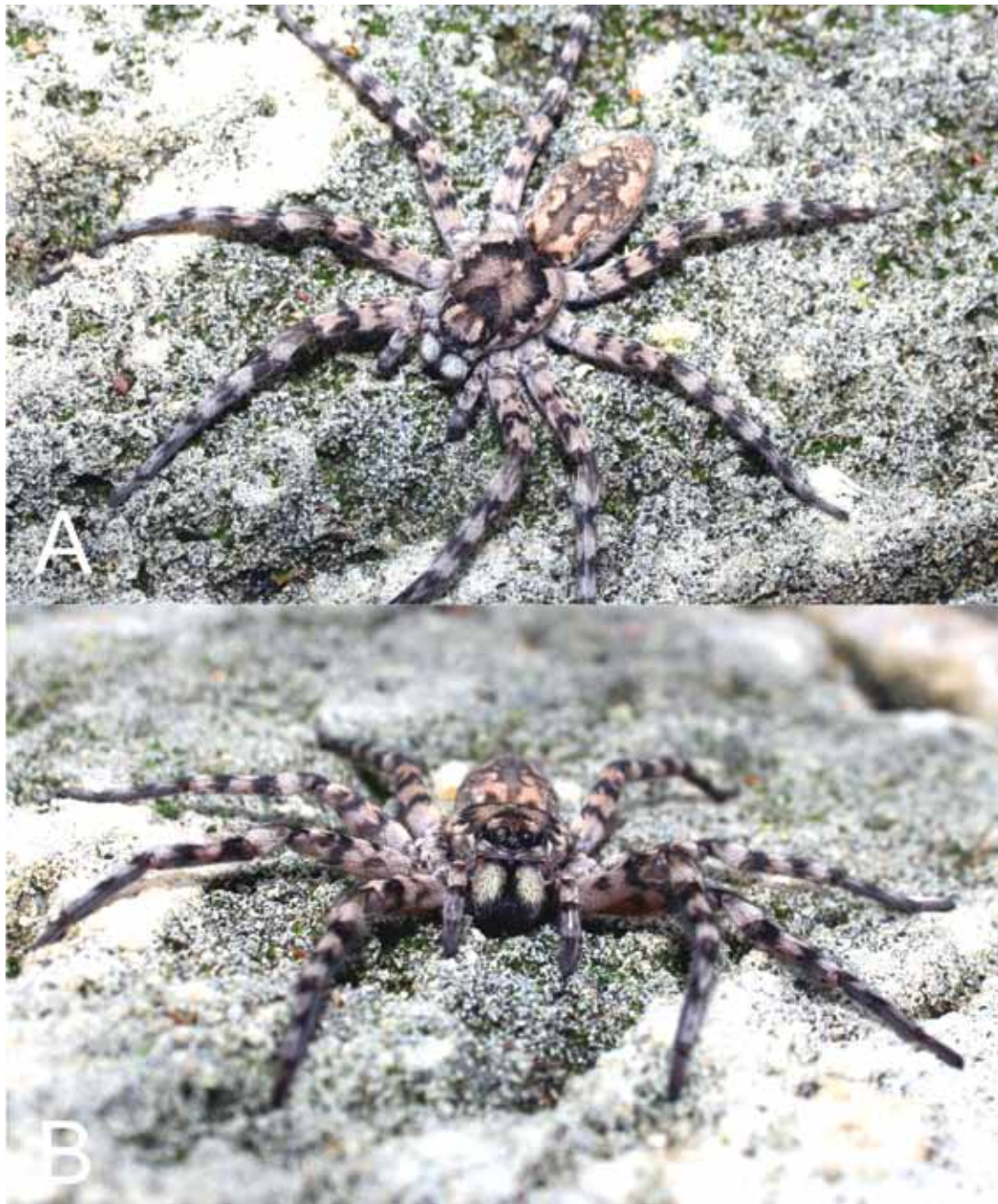
Figure 1 Tapetosa darwini sp. nov., immature from Lily McCarthy Rock (WAM T60365): A, dorsal and B, frontal view.

to celebrate the 200 th anniversary of Charles Darwin's birth in 1809 and the 150 th anniversary of the publication of his On the Origin of Species by Means of Natural Selection (Darwin 1859).